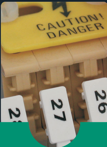
Terminal block markers