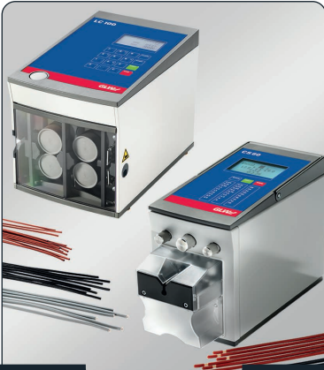
Stripping / cutting to length