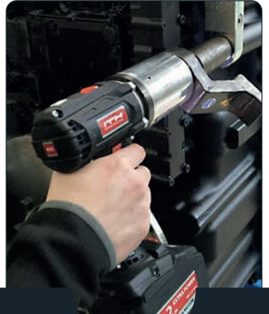
Torque nut runners