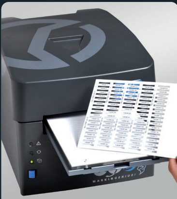
MG3 - Printer

In addition to the large number of direct panel components, Otto Schoch AG supplies various solutions for marking and industrial identification of control panels, terminals, modular components and control cabinets. The thermal transfer printers enable the rapid marking of cables and other elements requiring identification. The range of products is particularly extensive for the control and switchboard construction sector. Therefore we are able to satisfy the different requirements of the individual application areas in the best possible way.