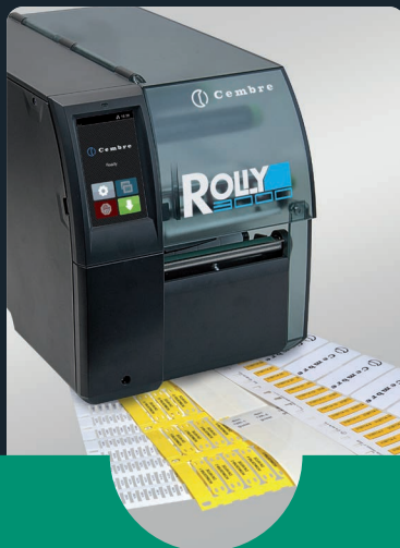
ROLLY3000 - Printer